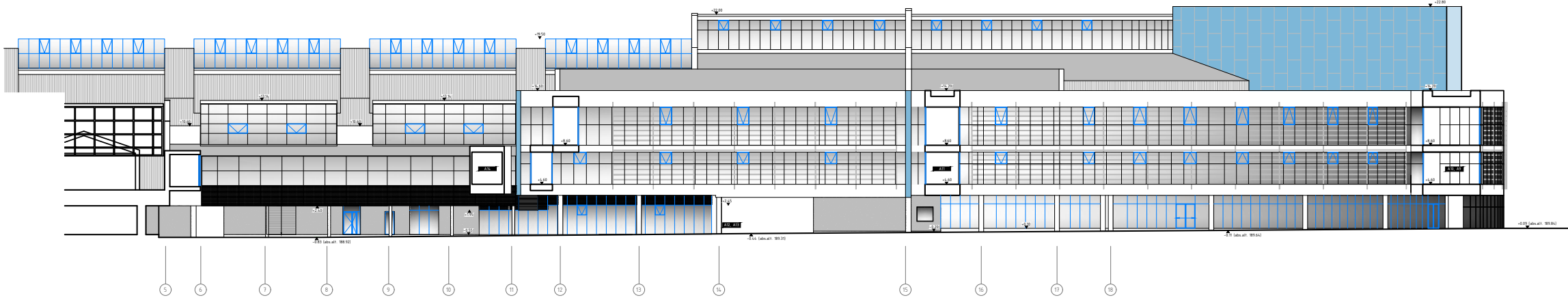
T2 / T3 PIETINIS FASADAS T2 / T3 SOUTHERN FACADE