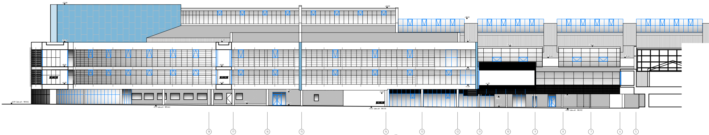
T2 / T3 ŠIAURINIS FASADAS T2 / T3 NORTHERN FACADE